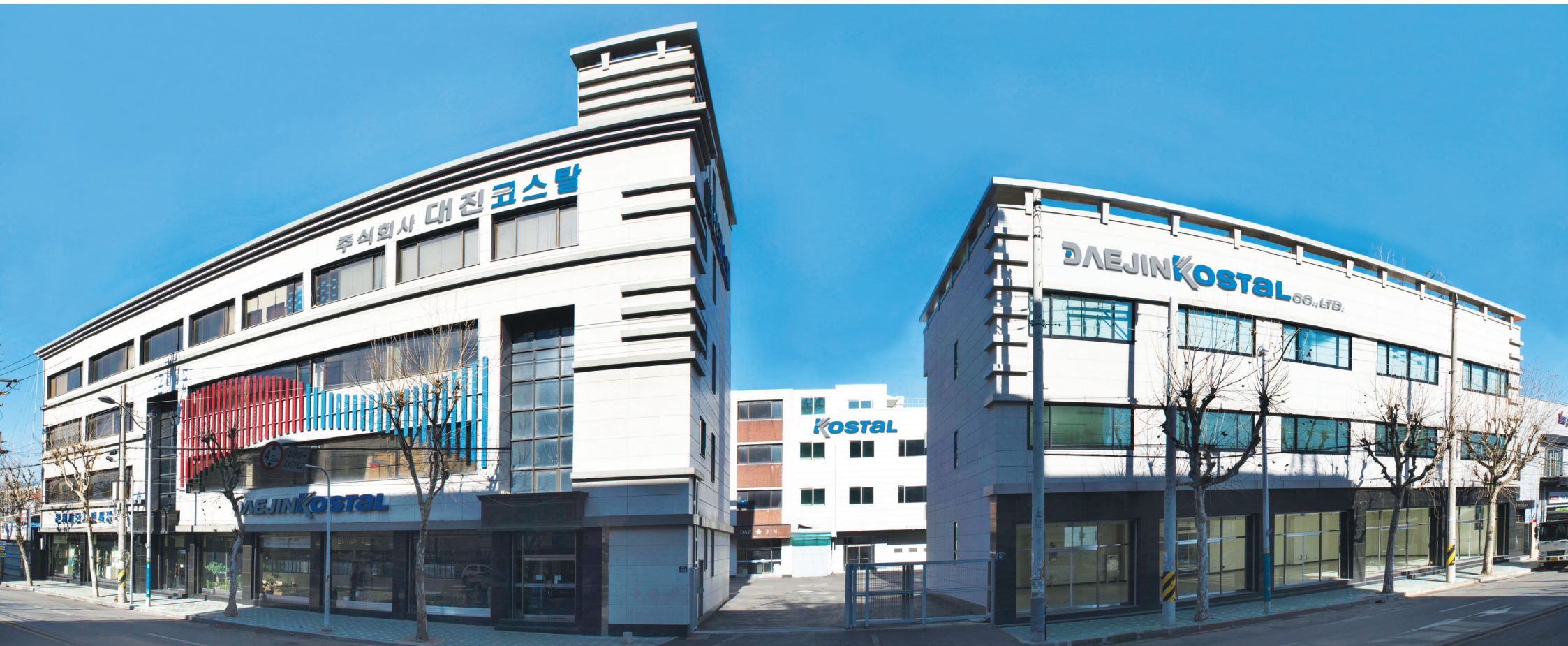
Headquarter / Factory