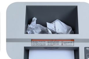
Powerful Shredding CD/DVD, ID & Credit Card