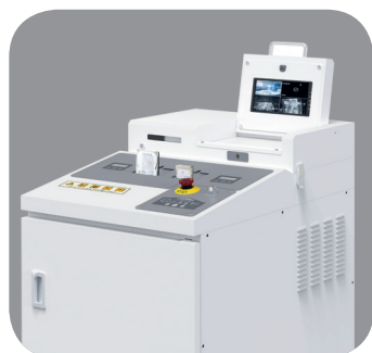
Recording System (Option)