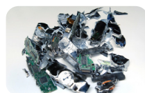
40 x random