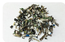
5 x random