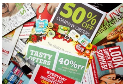
Flyer Direct mail