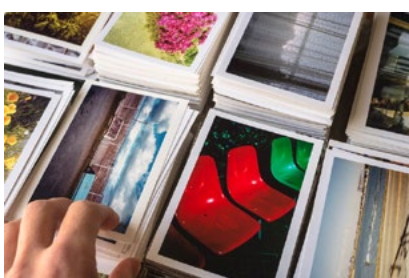
Digital print Photo card