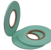
Inserting tab tape for Countron series.